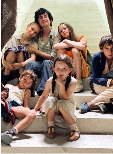
The six Jewish children – 1942 in a room at the Château de Chambord